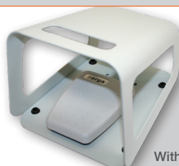
With 6202 Guard