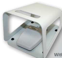
With 6202 Guard